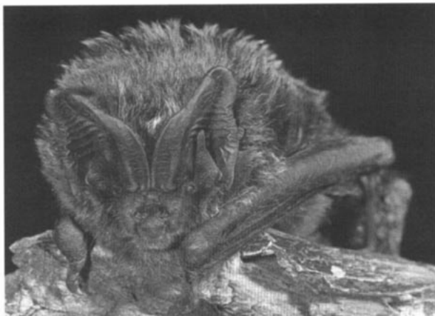
FIG. 1. Barbastella barbastellus from Griebenow (Kreis Greifswald, Vorpommern), eastern Germany.

DISTRIBUTION. The distribution of B. barbastellus is mainly European (Fig. 3). It ranges from southern Wales and north-eastern England (Arnold, 1993), southeastern Norway (northernmost occurrence at 60°N near Oslo—Syvertsen et al. 1995), southern Sweden (Rydell, 1983) and Latvia (Andrushaitis, 1985; Grevé, 1909; G. Petersons, pers. comm.), south to the southern European peninsulas, and east to western Belarus (Grodno and Brest—Kurskov, 1981), central Ukraine (Kiev, Kirovograd), and the mountains of the Crimea (Abeljantsev et al., 1956) through the Great Caucasus eastward to Daghestan and Azerbaijan (southeast to Lenkoran at the Caspian Sea and to Lerik in the foothills of the Talysh mountains—Amirkhanov, 1980; Kuzyakin, 1950; Rakhmatulina, 1988, 1989, 1995) and southeast to the Lesser Caucasus (Borshom in Georgia—Ognev, 1928; Lake Sevan in Armenia—Vereshchagin, 1959).